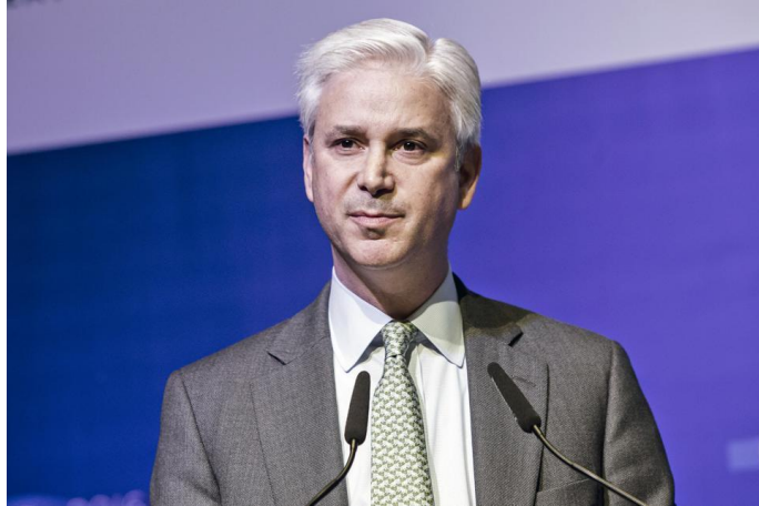
Charles Sharf - CEO WELLS FARGO